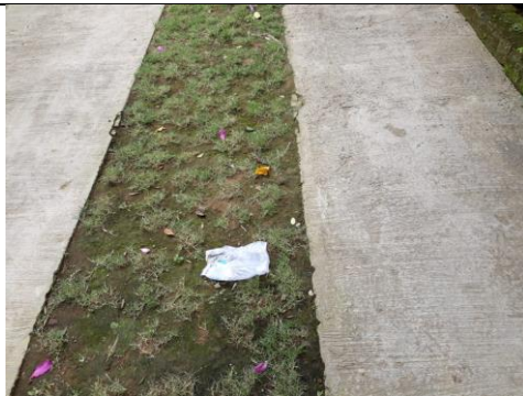
Rubbish on the way to room