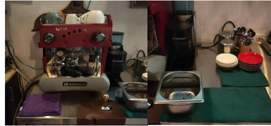
Correct coffee station set up