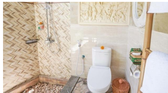
Toilet as per SOP