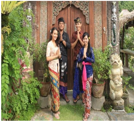
Front office Staff