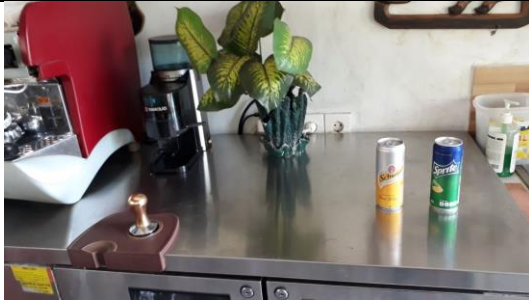
Incorrect coffee station set up