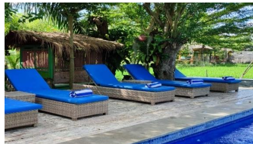
Correct long chair/ sun bed set up