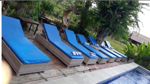
Incorrect long chair/ sun bed set up