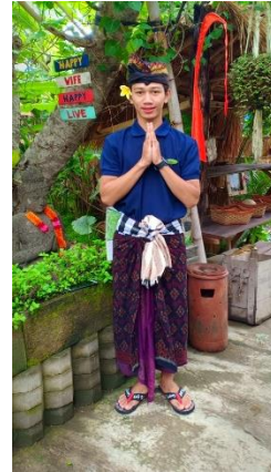
Bar Department Staff