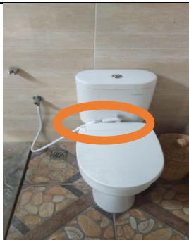
Jet shower on the toilet bowl