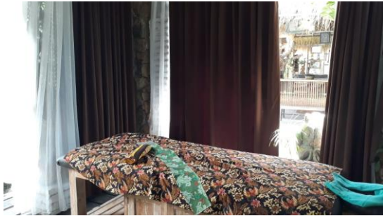
Messy bed set up