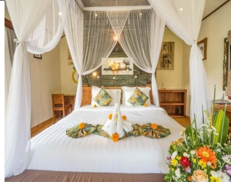
Bed set up as per SOP