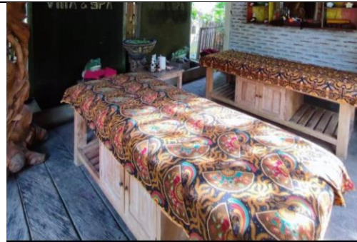
Clean bed set up